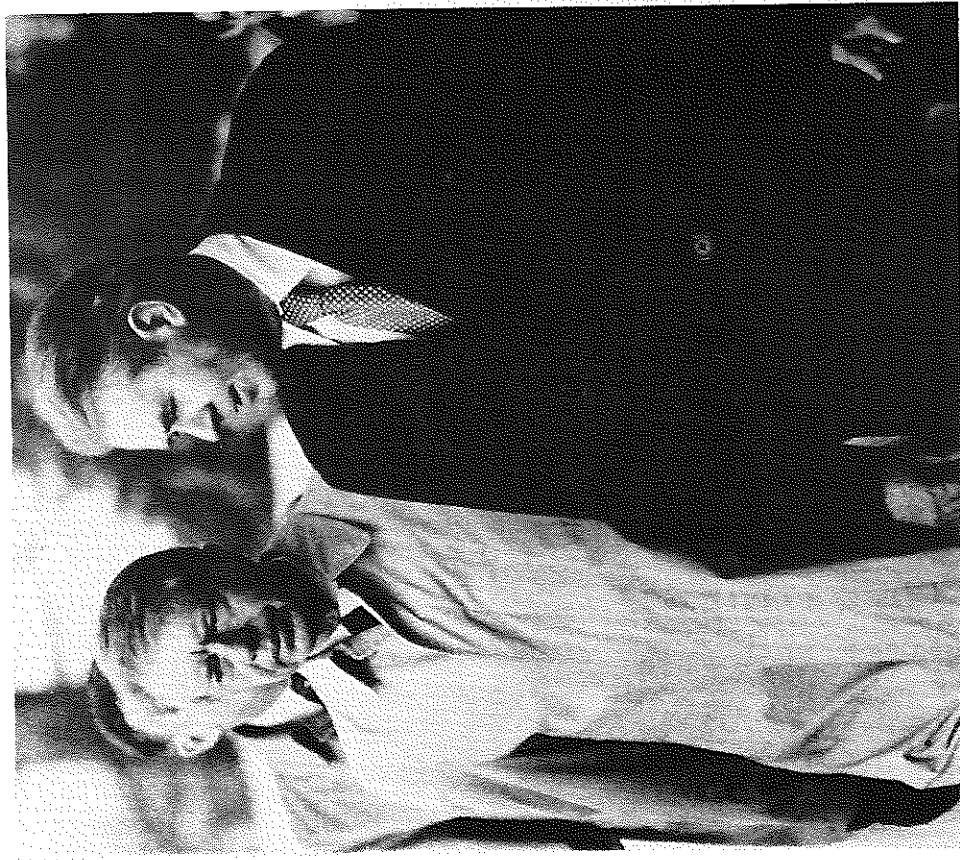
President Jimmy Carter and Secretary of State Cyrus Vance leaving the White House. Both became deeply perturbed in April 1980 when the military mission to rescue the American hostages in Iran ended in a fiasco. All the President's advisers had met and concurred on the military rescue mission while Vance—who had favored a diplomatic solution through negotiation—was away from Washington. When Vance returned, he opposed the decision as "ill conceived," but no one took his cogent arguments seriously and he resigned in protest.

A report prepared by the staff of the Senate Armed Services Committee, released in June 1980, concluded that "major errors" were made in the planning as well as the execution of the military operation. Poor contingency planning and inadequate intelligence were among the specific criticisms. A similar conclusion was reached in a less controversial report by a high-level military review panel for the Joint Chiefs of Staff. The report, released in August 1980, concluded that although the concept of a small clandestine operation