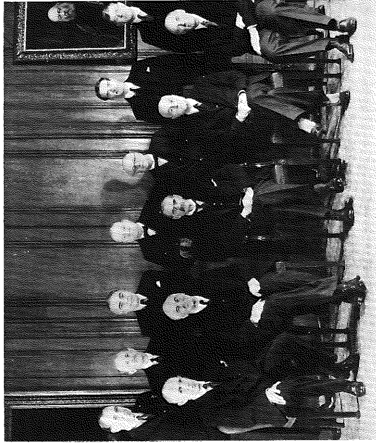
Members of Neville Chamberlain's War Cabinet with the ministers who formed his "inner circle" sitting in the front row. Seated, left to right, are: Viscount Halifax, the Foreign Secretary; Sir John Simon, the Chancellor of the Exchequer; Neville Chamberlain, the Prime Minister; and Sir Samuel Hoare, Home Secretary. Also seated, on the far right, is Lord Chatfield, Minister for the Coordination of Defence. Standing, left to right, are: Sir John Anderson, Minister for Home Security; Lord Hankey, Minister without portfolio; Leslie Hoare Belisha, War Minister; Winston Churchill, First Lord of the Admiralty; Sir Kingsley Wood, Air Minister; Anthony Eden, Dominions Minister; and Sir Edward Bridges, permanent secretary and secretary of the War Cabinet. Two other members of Chamberlain's inner circle were not members of the Cabinet: Sir Horace Wilson, permanent secretary (in the Civil Service) and the Prime Minister's closest adviser on foreign affairs, and Sir Neville Henderson, Britain's ambassador to Germany.

The groupthink syndrome may provide a large part of the solution to this puzzle. There are many indications that the group developed a shared illusion